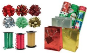
Ribbons & bows, foil or plastic coated gift wrap & gift bags

These items should NOT be placed in your recycling bin, BUT CAN BE RECYCLED/REUSED AT THESE LOCATIONS.